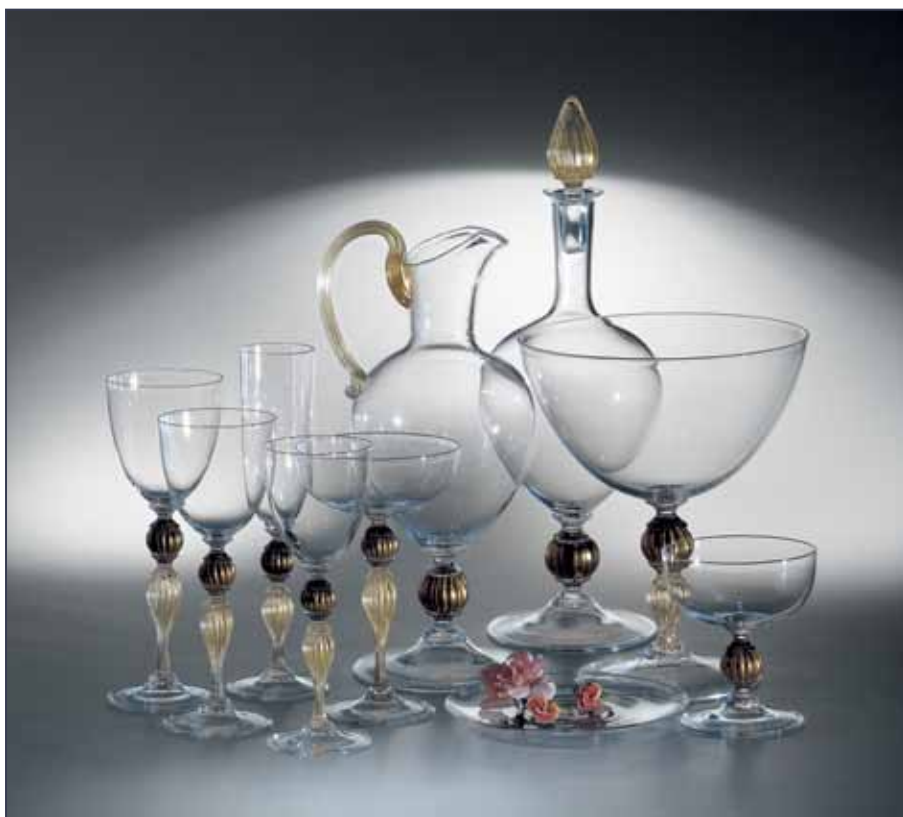
Davide Fuin, Glassware Set in various sizes, 2000.

There are a few small technical differences between glassblowing in the United States and in Italy. American glassblowers use the glory hole frequently, but on Murano it would mainly be used for larger work. Also, Italians use a fork-like tool to place work in the annealer versus the big silver astronaut-like gloves we see stateside. But the primary difference is philosophical, not technical. "On Murano glassblowing is work. It's not thought of as something one does exclusively for fun or artistic expression."